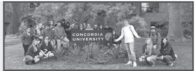
ECMC students visit Concordia College.