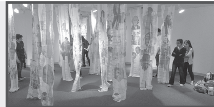
Students view art work at Pendleton Center for the Arts.

$278 March 13-24, 6th graders at Sunridge Middle School traveled to the Pendleton Center for the Arts to view a group of Chuck Close prints being shown at PCA. Each class visited the art center to experience the exhibit and participate in a guided discussion about Close's process.