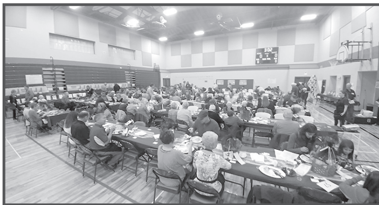
Dinner guests at 2016 Grillin' for Grants.

The 2016 fundraiser garnered more than $22,000 to fund enrichment experiences for students in Pendleton schools. Grillin' for Grants allows the Education Foundation to provide more funds for more projects. We hope to increase attendance and funds raised.