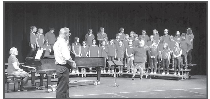
Sherwood Heights Elementary Choir performs at festival.