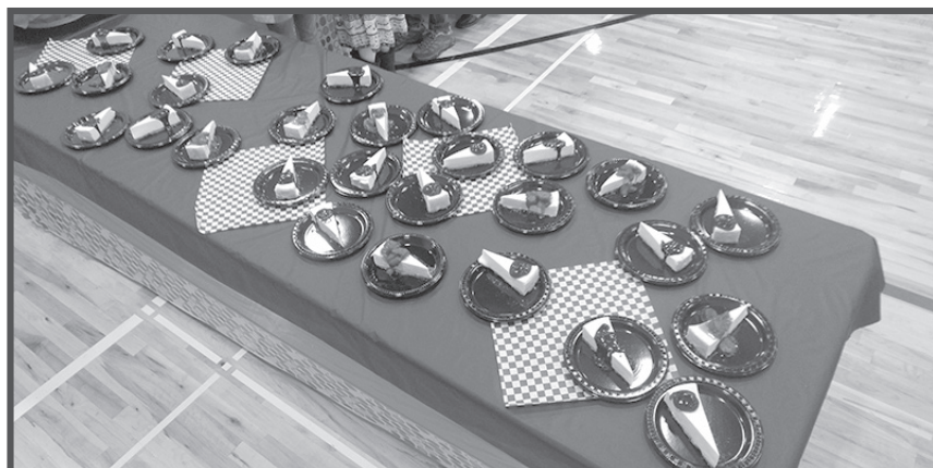
Dessert served at last year's Grillin' for Grants dinner.

Multiple levels of sponsorship are available for those interested in helping to support Grillin' for Grants. Sponsorships are vital to this fundraising event. Individuals and business sponsors receive recognition at the event, on the website and FB page and on some promotional materials. If you or your business would like to be a Grillin' for Grants sponsor, please contact Lona Odom at lona.efp@gmail.com .