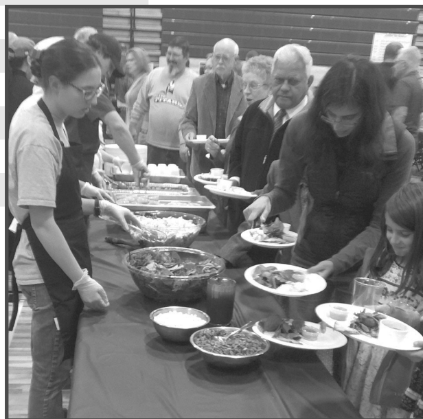
Many delicious choices were presented to attendees at the Grillin' for Grants dinner and auction.