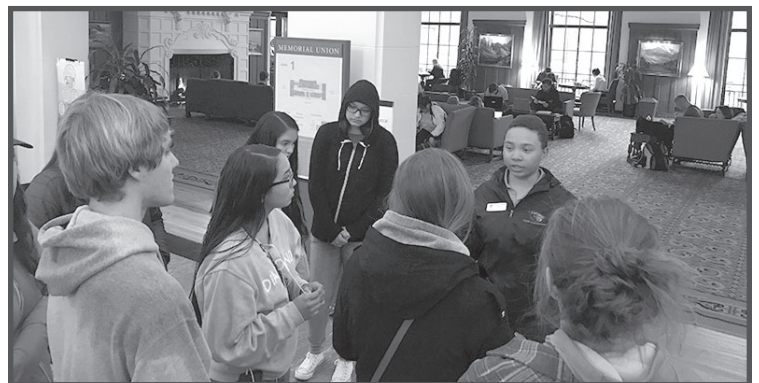
ASPIRE students visited several campuses during the college tour.