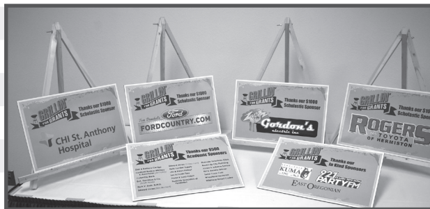
Grillin' for Grants sponsors are recognized.

Any individual or business can be a Grillin' for Grants sponsor, so please contact a board member or visit the website if you are interested.