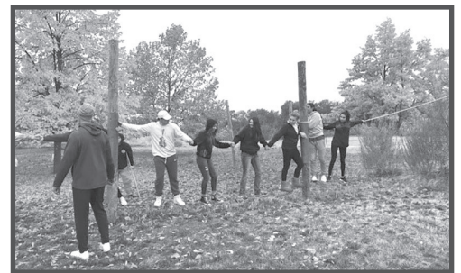
Students tackle the Hawk Point Challenge Course in Walla Walla.