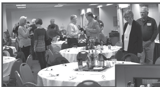
Patrons enjoy the new venue and dinner at the Pendleton Convention Center.

Half of the funds raised at the event will be awarded in spring 2018 for Pendleton School District grants to teachers. The other half will be added to the foundation's endowment to increase the amount available for future grants.